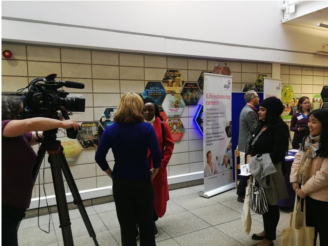
Figure 1: School of Applied Science students interviewed by ITN at the RSB Bioscience Careers Day 2018 (Manchester).