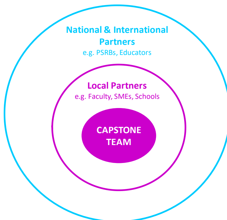
Figure 3: Evolving Community of Practice. The core Leeds team, local partners and a developing nationally and international community

I intend to pro-actively develop this community going forward. Collectively progressively realising the full potential of capstones for students, Institutions and Society. My ultimate goal, interdisciplinary, TNE capstones which address global grand challenges and UN SDGs.